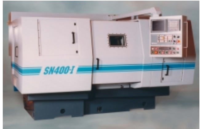
SN400-I HAND LOADER

The SN-Series Internal Grinders have been engineered to help optimize your grinding operations and to excel in a wide range of applications. With swings up to 24", many operations including ID, OD, Face and Profile grinding can be performed. A highly stable, torsion resistant machine platform is coupled with SNI's proprietary hydrostatic slide system, rigid dressing system, variable speed controls and full enclosure guarding.