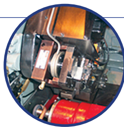
Servo-Driven Roll-Form Dress