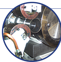
Tri-Roll Work Fixture